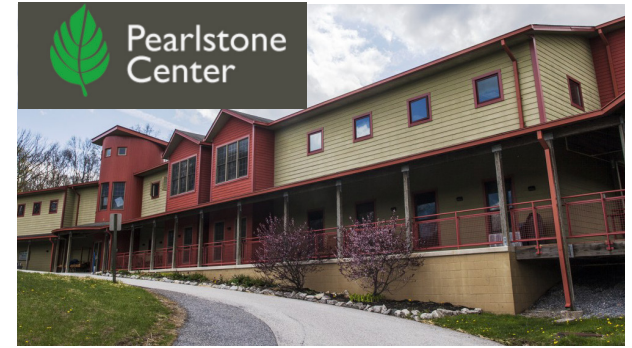
The Pearlstone Retreat Center is an environmentally-friendly conference and retreat center nestled in the beautiful Maryland countryside just outside of Baltimore.

What is a gentle and quiet spirit and how do we develop one? How should we as Christian women adorn ourselves?