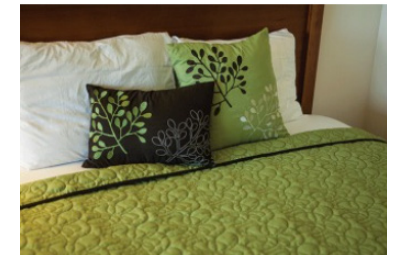
To view Pearlstone accommodations visit www.pearlstonecenter.org .